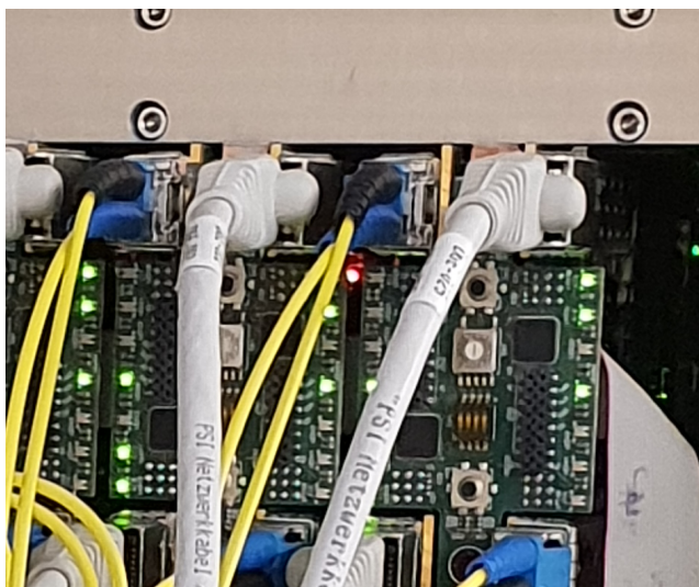
Figure 4: 1 and 10GB LEDs position.