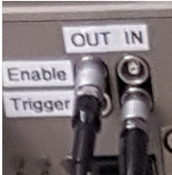
Figure 3: Trigger INPUT (looking at a single module from the back, top) is the rightmost, down .

This also means that exptime < subexptime will be rounded to subexptime . If you want shorter acquisitions, either reduce the subexptime or switch two 16-bit mode (you can always sum offline if needed).