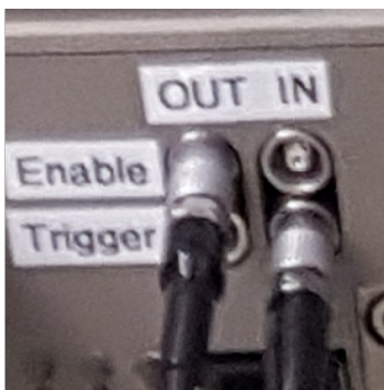
Figure 3: Trigger INPUT (looking at a single module from the back, top) is the rightmost, down .

between frames from the default 12 \mu\text{s} to something configurable, expected to be 15\text{--}40 \mu\text{s} (for the 9M it is currently 200 \mu\text{s} due to a noisier module).